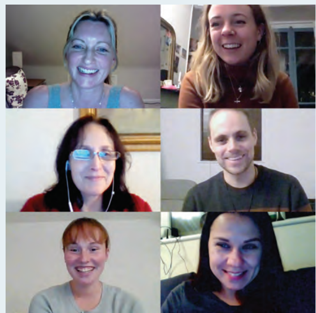
Photo at top: students at Lewis School of English. Photo on right: CertTESOL graduates and tutors, November 2020.