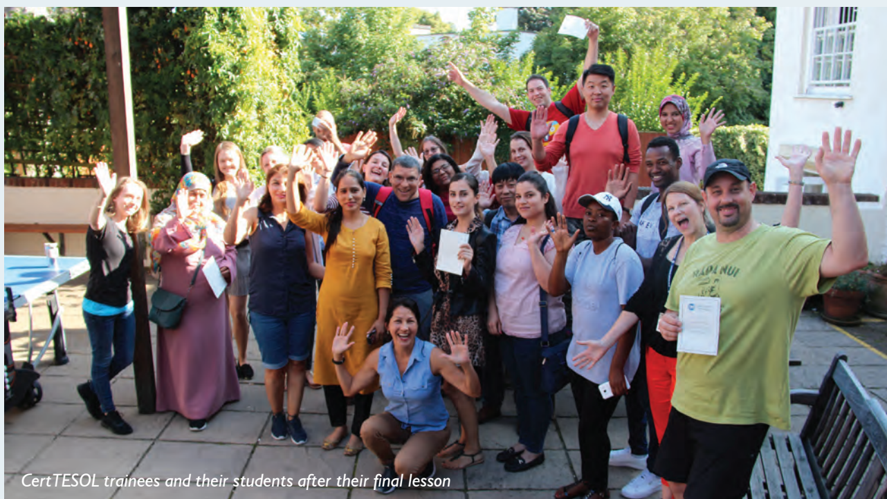
CertTESOL trainees and their students after their final lesson

Every time you teach you will be expected to design materials for your lesson. Towards the end of the course you will select one piece of material from one of your lessons and evaluate its effectiveness.