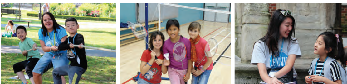
Above: English lessons. Left to right: team games, badminton, activity leader and student on trip

At our Kids Camps, we place great emphasis on care and supervision, with a high staff:student ratio on activities (1:8) and separate accommodation.