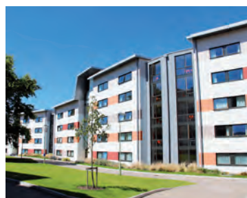
Above: English lessons, London trip. Left to right: bedroom, friends on campus, accommodation block