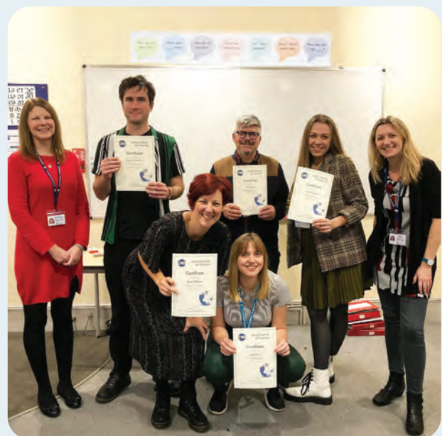
Photo at top: students at Lewis School of English. Photo on right: CertTESOL graduates and tutors.

Student-centredness is at the heart of what we do, and we will make sure that you are involved and engaged throughout the course, offering you support in your written assignments and teaching practice.