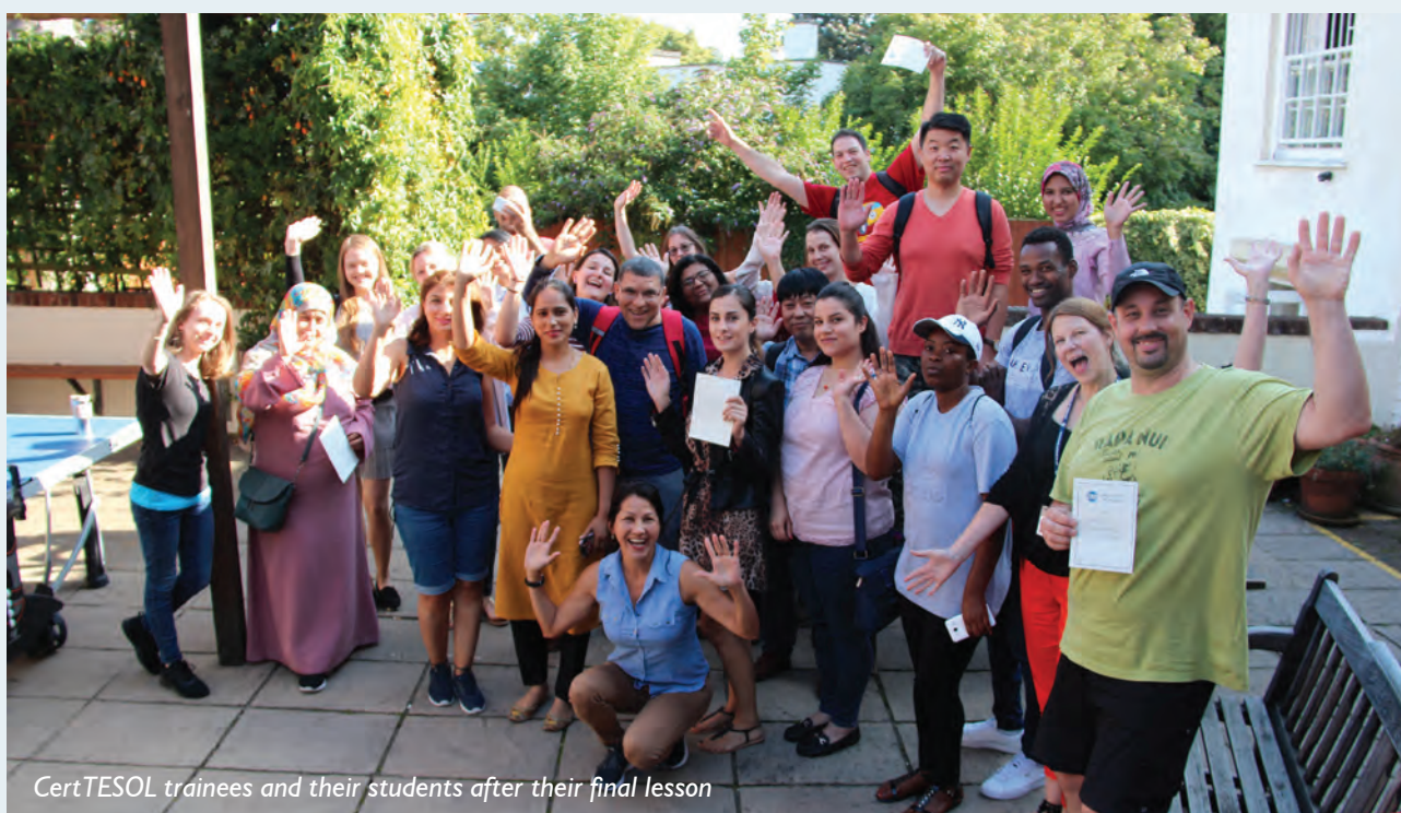
CertTESOL trainees and their students after their final lesson

Every time you teach you will be expected to design materials for your lesson. Towards the end of the course you will select one piece of material from one of your lessons and evaluate its effectiveness.