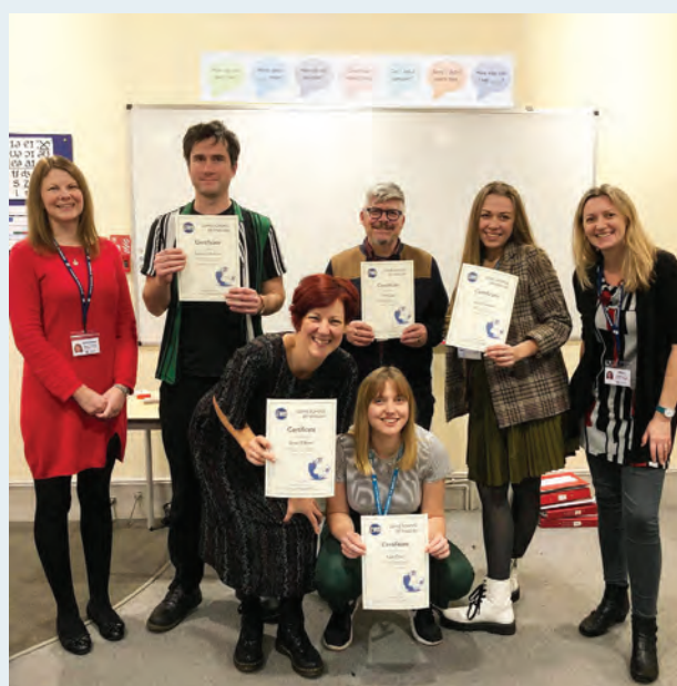
Photo at top: students at Lewis School of English. Photo on right: CertTESOL graduates and tutors.

Student-centredness is at the heart of what we do, and we will make sure that you are involved and engaged throughout the course, offering you support in your written assignments and teaching practice.