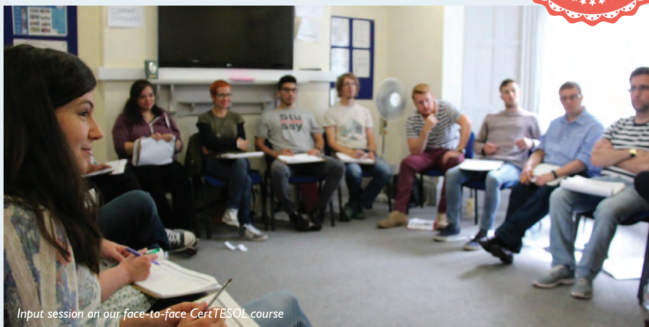
Input session on our face-to-face CertTESOL course

“It’s a bit like ‘teaching boot camp’... in a good way! It’s rewarding and enjoyable.” Becky Sloper