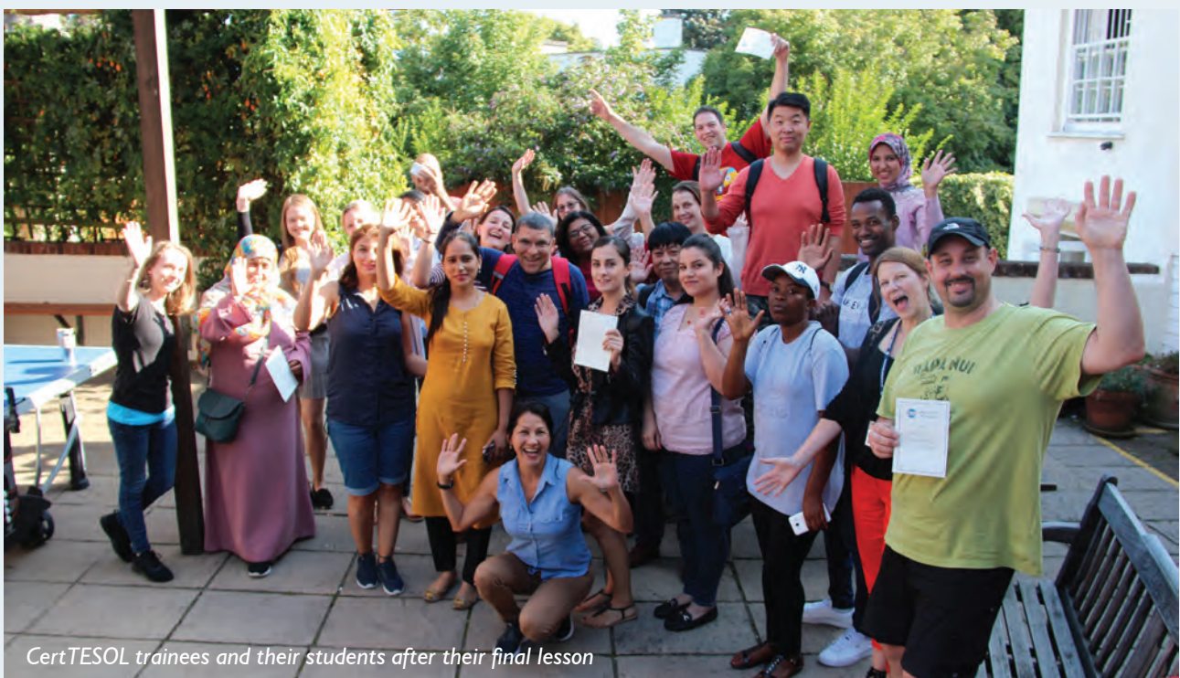
CertTESOL trainees and their students after their final lesson

Every time you teach you will be expected to design materials for your lesson. Towards the end of the course you will select one piece of material from one of your lessons and evaluate its effectiveness.