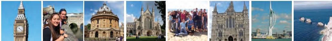
Trip destinations (left to right): London, Bath, Oxford, Winchester, Bournemouth, Salisbury, Portsmouth, Isle of Wight