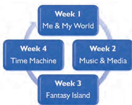
Classic Programme Syllabus Themes