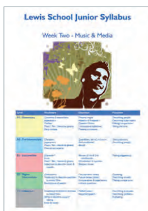
Classic Programme Syllabus Overview

You will develop your language skills by actively learning about our fascinating culture. Your teacher will spend all morning and afternoon with you, taking you to places of interest where you will conduct research, and return to the classroom to build on your cultural knowledge and language skills as you work towards a final presentation