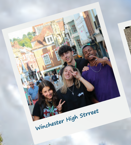
Winchester High Street

With riverside walks, hilltop views and a buzzing centre with enticing shops and restaurants, you're sure to love this special city.