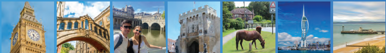
London Oxford Bath Southampton New Forest Portsmouth Bournemouth