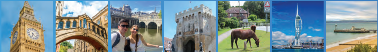
London Oxford Bath Southampton New Forest Portsmouth Bournemouth