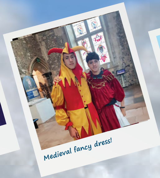
Medieval fancy dress!