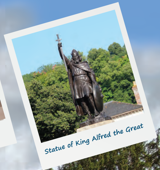
Statue of King Alfred the Great