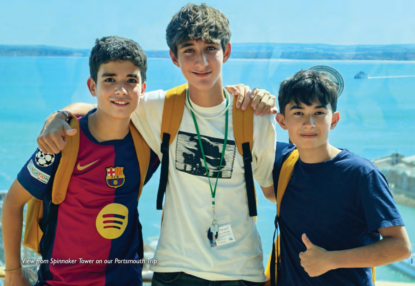
View from Spinnaker Tower on our Portsmouth Trip

We take great care to ensure the safety and well-being of all our students, and for this reason we have very robust safeguarding procedures. For example, all of our staff are DBS-checked (police-checked) and receive training in safeguarding issues. You can read our Safeguarding Policy in full on the School Policies page of our website.