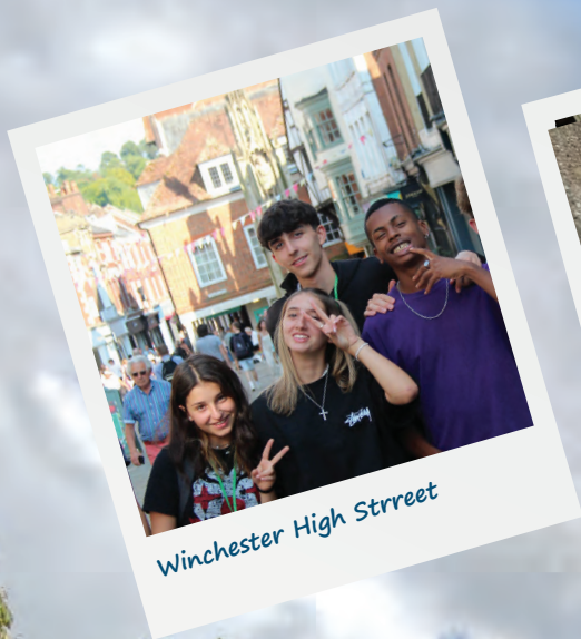
Winchester High Street

With riverside walks, hilltop views and a buzzing centre with enticing shops and restaurants, you're sure to love this special city.