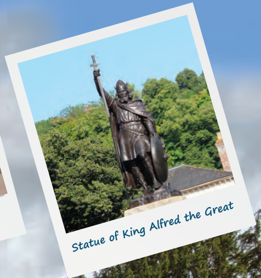
Statue of King Alfred the Great