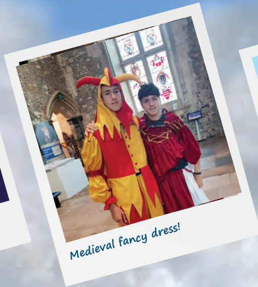
Medieval fancy dress!