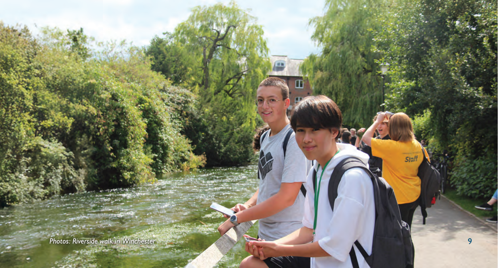
Photos: Riverside walk in Winchester

*'Chill Out' periods are unsupervised free time for students to relax, study or socialise. If they are outside the residence, they must stay on campus within a designated area and in groups of 3+. Staff can be contacted if needed. Students aged 15+ with permission from parents and the Centre Manager can go into the city centre during afternoon chill out time (not in the evening) and on Sunday mornings/afternoons. They must stay in groups of 3+ and keep their phone switched on.