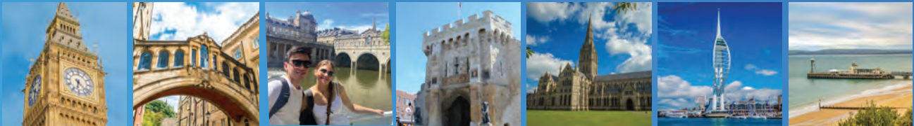
London Oxford Bath Southampton Salisbury Portsmouth Bournemouth