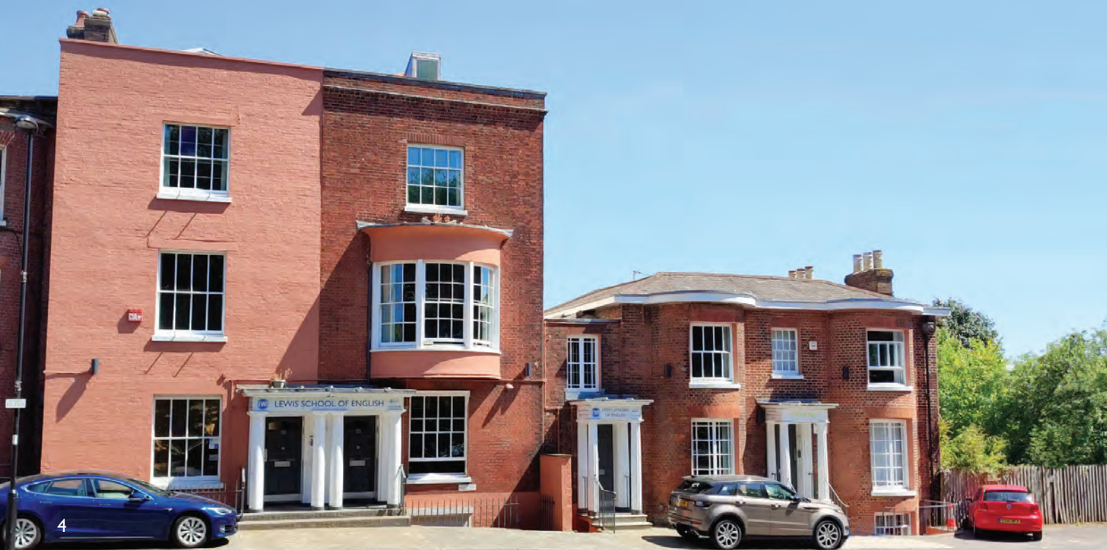
Above: table tennis, school patio, classroom. Below: front of school.