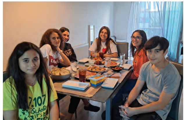
Photos show four different homestays.