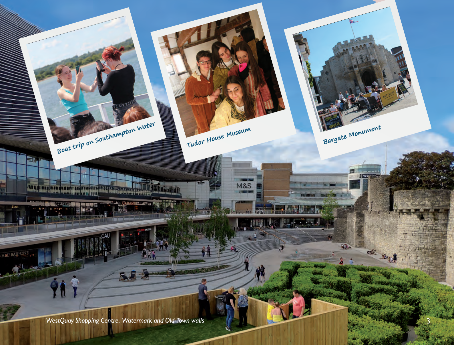
WestQuay Shopping Centre, Watermark and Old Town walls