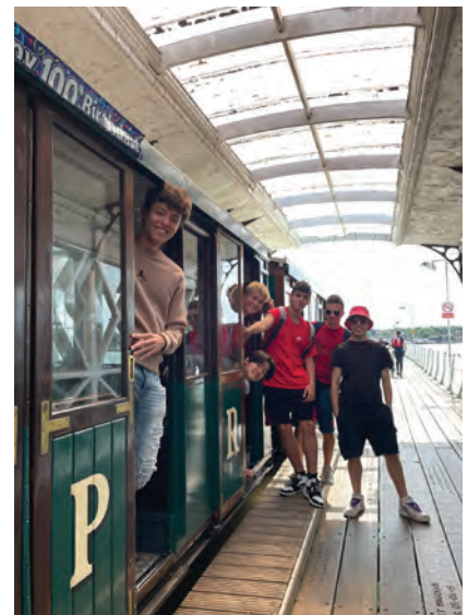
Photo: Pier train on a local visit to Hythe