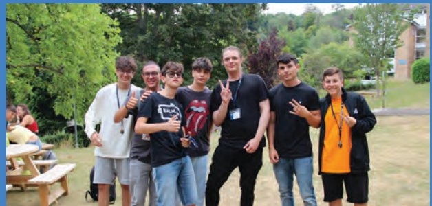
Photos show campus views, disco venue and sports hall.