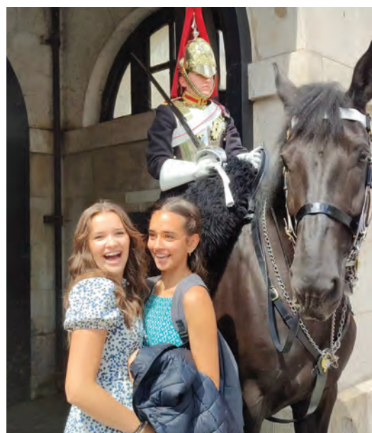
Horse Guards' Parade on our London trip