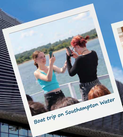
Boat trip on Southampton Water