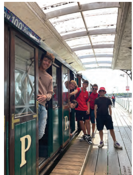
Photo: Pier train on a local visit to Hythe