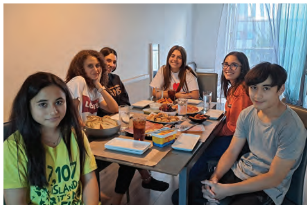
Photos show four different homestays.