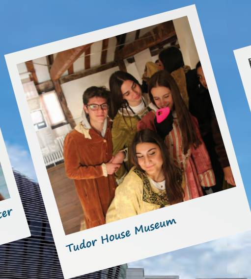
Tudor House Museum