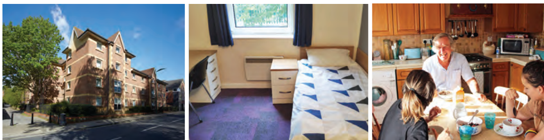
Left to right: Residential accommodation, bedroom in residence, homestay accommodation.