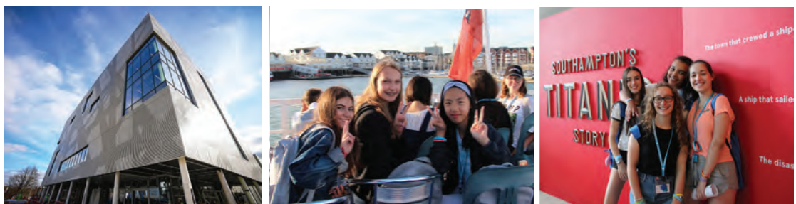
Above: Spark Building, Solent University. Left to right: sports centre, boat party, Titanic exhibition at SeaCity Museum.

*The age range is 11-17. However, we may accept a younger or older student from the same school year as someone else in the group.