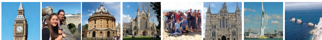
Trip destinations (left to right): London, Bath, Oxford, Winchester, Bournemouth, Salisbury, Portsmouth, Isle of Wight