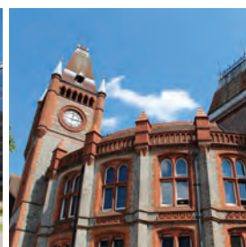
Reading town centre