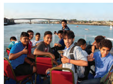
Left to right: selfie on Oxford Trip, IT workshop, boat party. *Residential accommodation in Southampton is available from 5 July