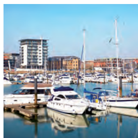
Southampton city centre