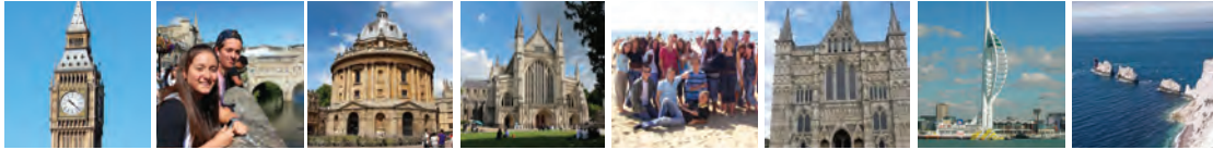
Trip destinations (left to right): London, Bath, Oxford, Winchester, Bournemouth, Salisbury, Portsmouth, Isle of Wight