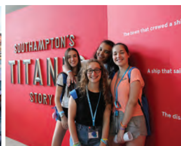
Above: Spark Building, Solent University. Left to right: Solent University, boat party, Titanic exhibition at SeaCity Museum.