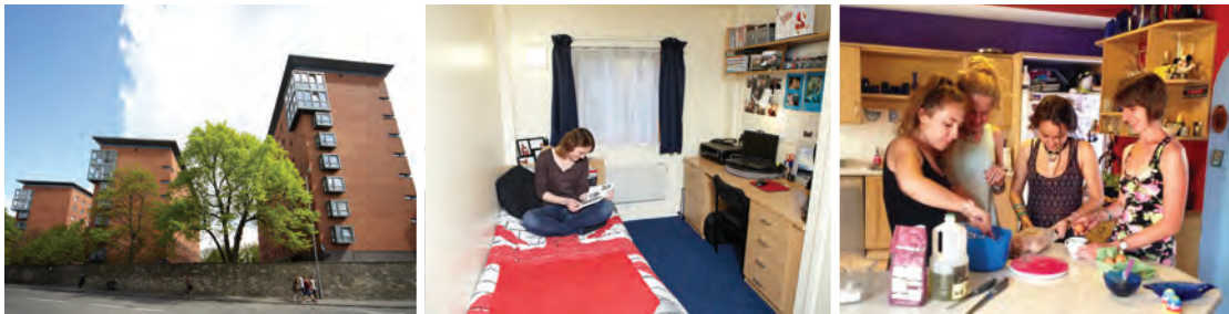
Left to right: Residential accommodation, bedroom in residence, homestay accommodation.