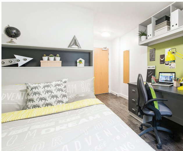
Single en-suite bedroom

Studios in Crescent Place are self-contained flats 22-24 sqm in size. They provide the same facilities as a single en-suite room plus your own kitchen/dining area.