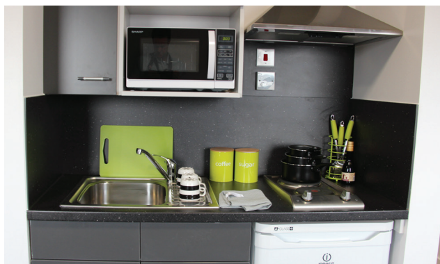
Kitchen area in studio