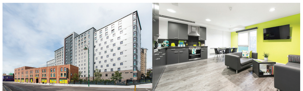
Photos: kitchen / living area in shared flat exterior of Crescent Place.

Advance Payment (£250): this amount will be deducted from the total rent balance